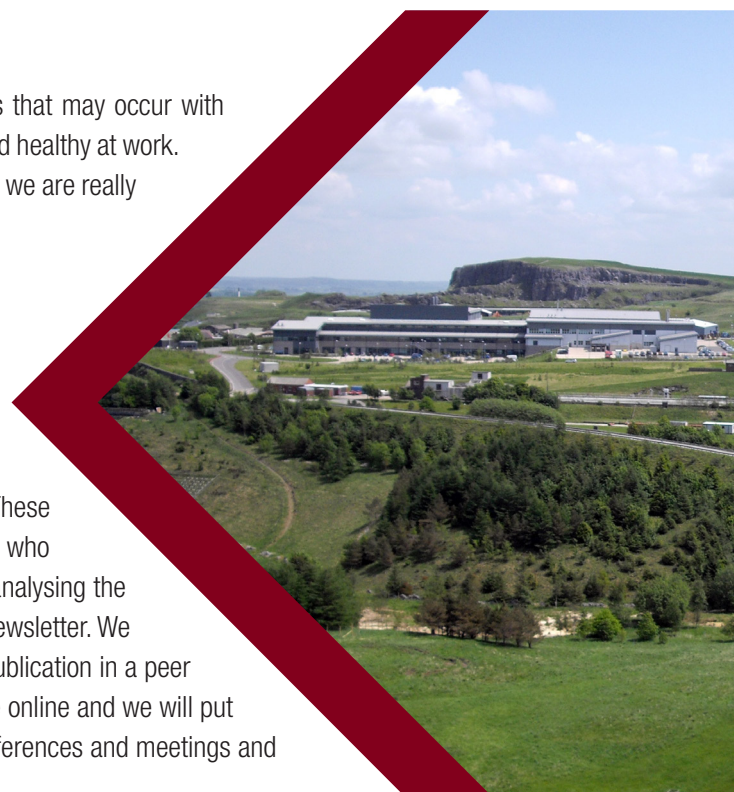
The Buxton laboratory

We had a wonderful response to our invitation to complete the Respiratory Health and Pesticide Use Questionnaire in January 2018. Nearly 2600 study members returned completed questionnaires and we are very grateful to everyone who took part. These data provide a valuable snapshot of respiratory health among people who use, or have previously used, pesticides in Britain. We are still busy analysing the data we collected, but we have included some early results in this Newsletter. We plan to write a more detailed manuscript, which we will submit for publication in a peer reviewed journal. Once published, the article will be freely accessible online and we will put a copy on our website. We will also present the work at relevant conferences and meetings and provide an update in next year's Newsletter.